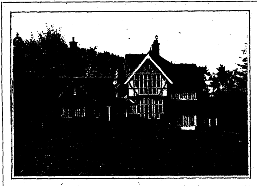
COOMBE HEAD, HASLEMERE.

The anniversary of the death of Edith Cavell was chosen as the occasion of two most interesting